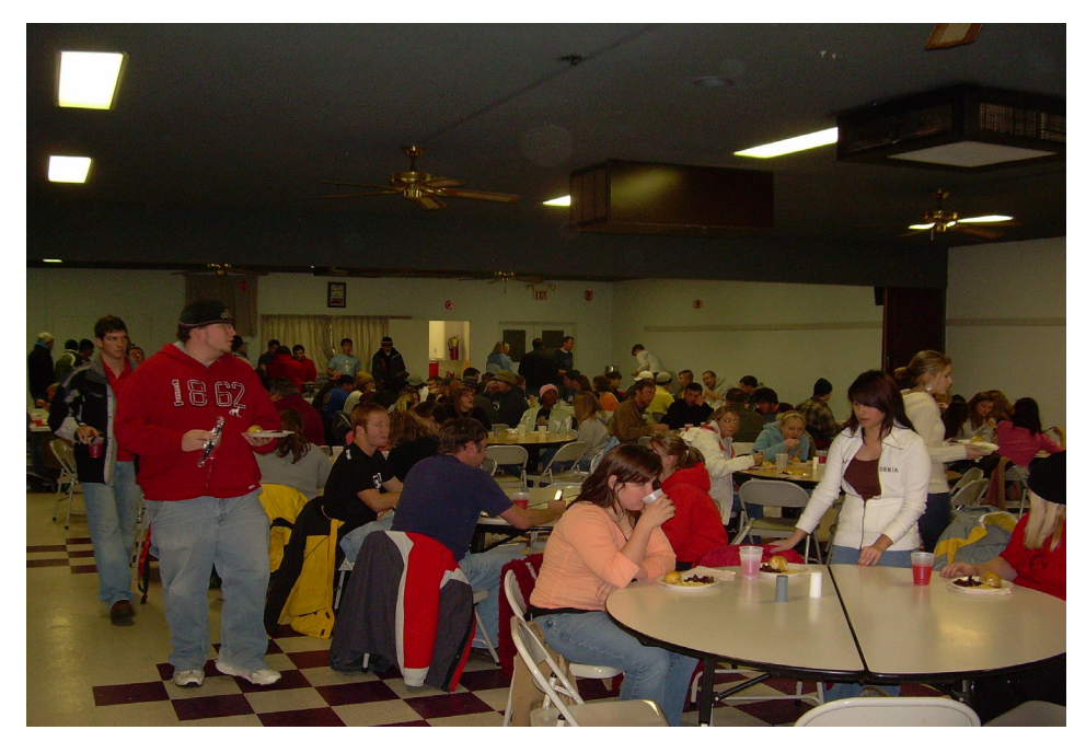
Just under 200 members of the USD community showed up in support of the annual SDA chislic feed.

Since the chapter did such a great job with these events we have been directly contacted by another organization to participate in the Relay for Life in January. Our good deeds are not going unnoticed! They even requested for one of our members