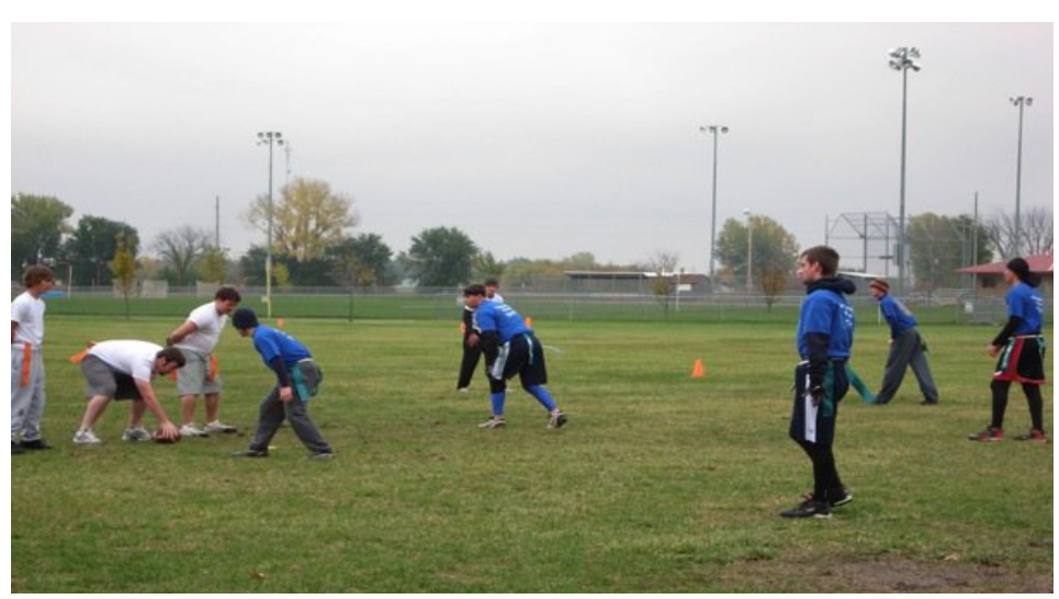
Phi Delta Theta members compete in a flag football game against Tau Kappa Epsilon this fall. The team ended the year 5-1.

We plan on continuing our flag football and basketball teams into the spring semester.